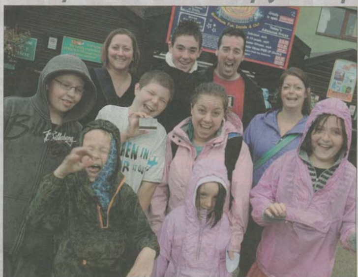
A great time was had by all: parents and children at Crealy near Exeter

A bowling trip, canoeing, and a visit to Crealy Adventure Park were among the attractions during this year's Children's Activity Week, which took place in August.